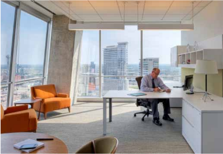
Boston Consulting | Dallas, TX