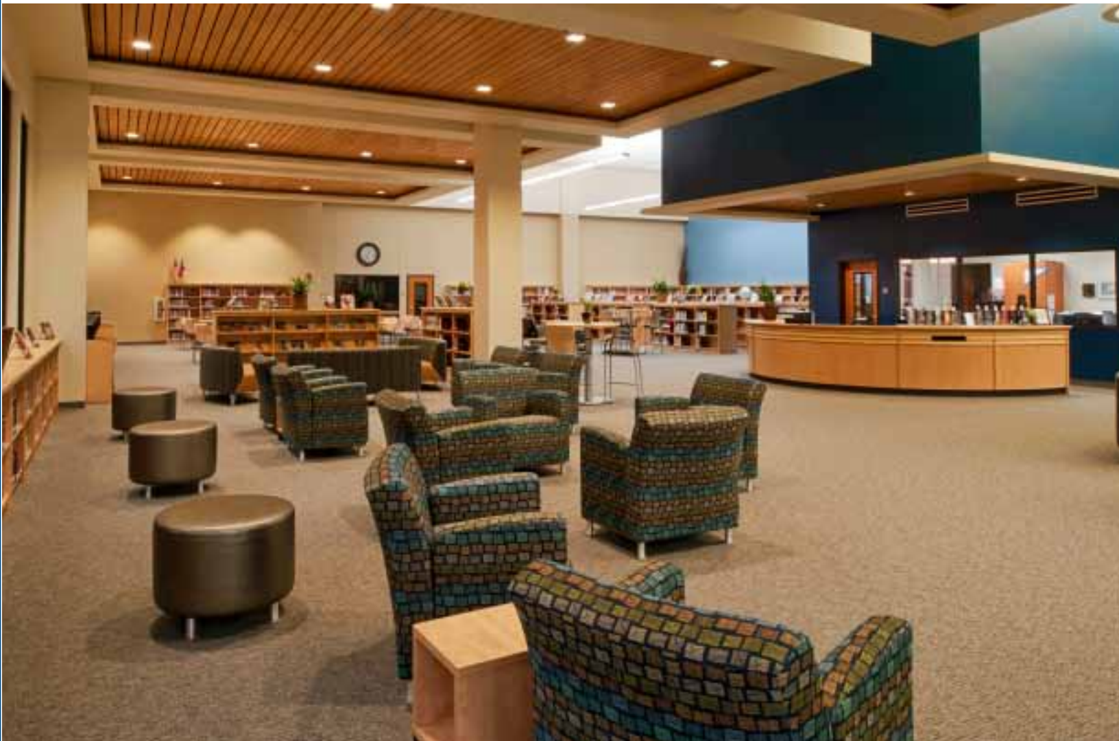
McMillen High School | Murphy, TX

Schools competing for the best students and faculty, students preparing for a changed economy, and leaders driving a global educational revolution grow more impatient for the 21st Century classrooms, libraries, kiosks, lounges, cafes, labs, living and office spaces needed to bring the revolution to life.