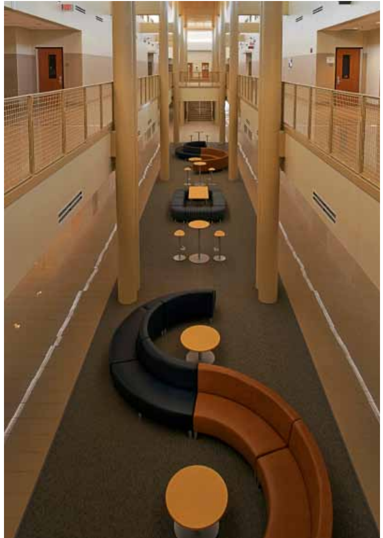
McMillen High School | Murphy, TX