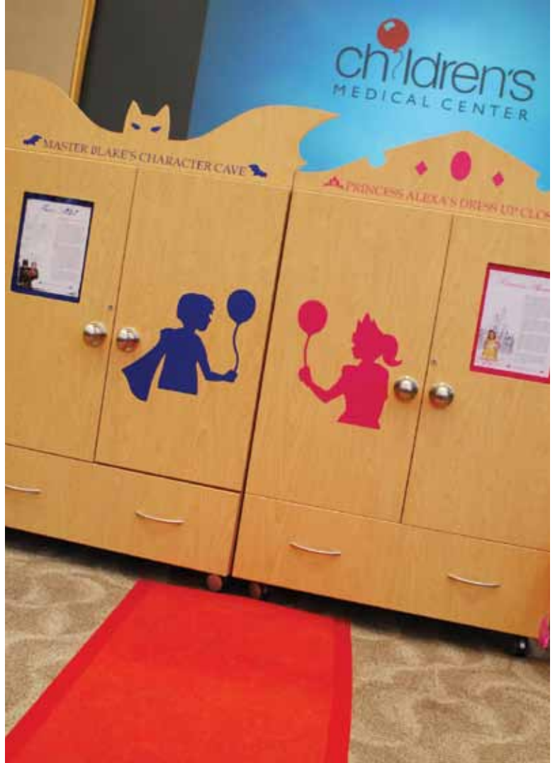
Childrens Medical Center | Dallas, TX