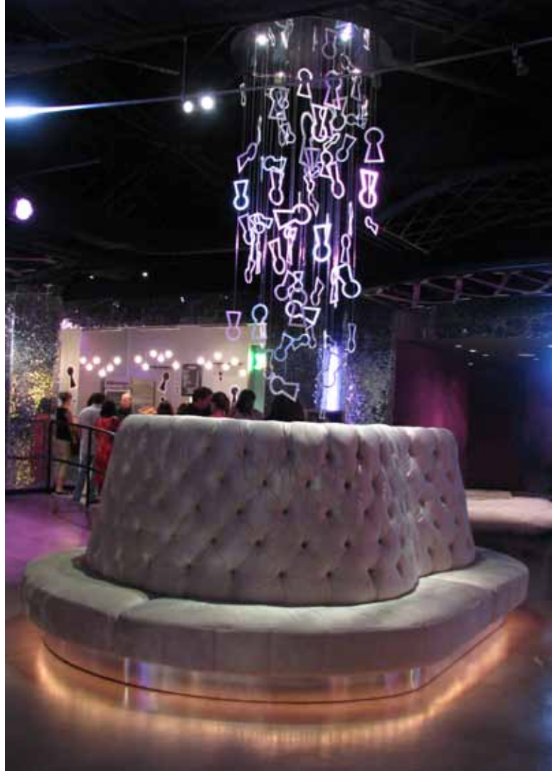
Planet Hollywood Hotel | Las Vegas, NV