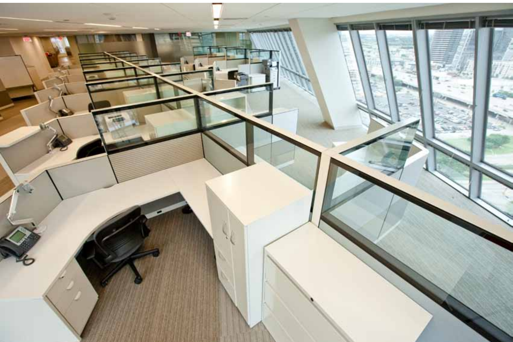
Tenet | Dallas, TX