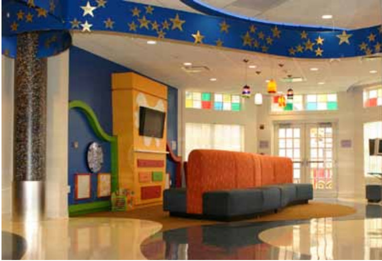
Our Childrens House | Dallas, TX