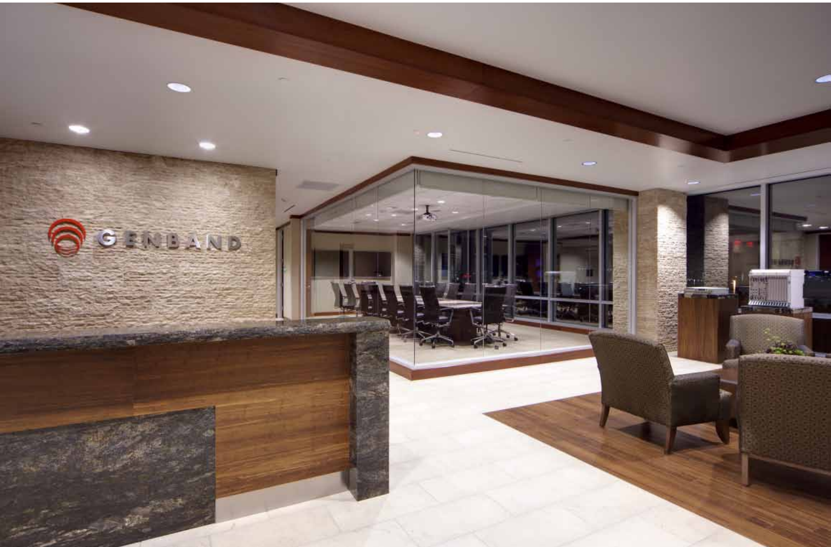
Genband | Plano, TX