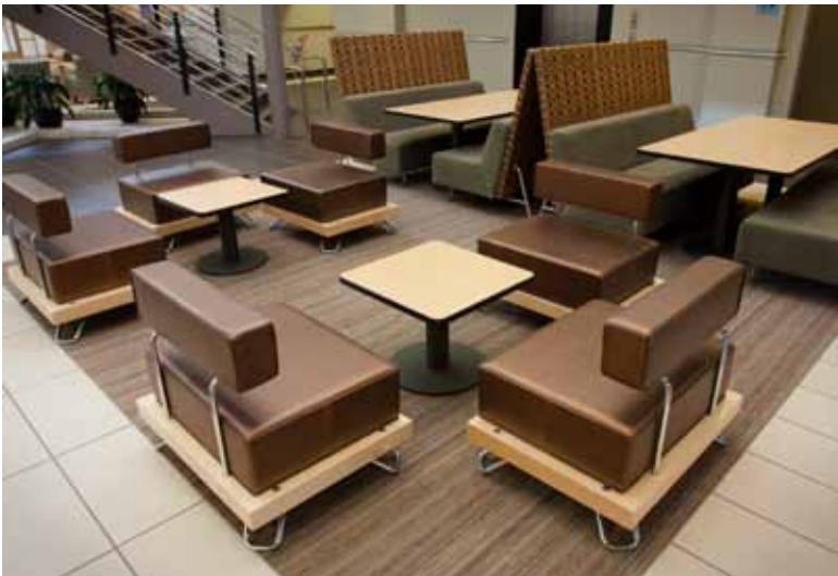
Northlake College | Irving, TX