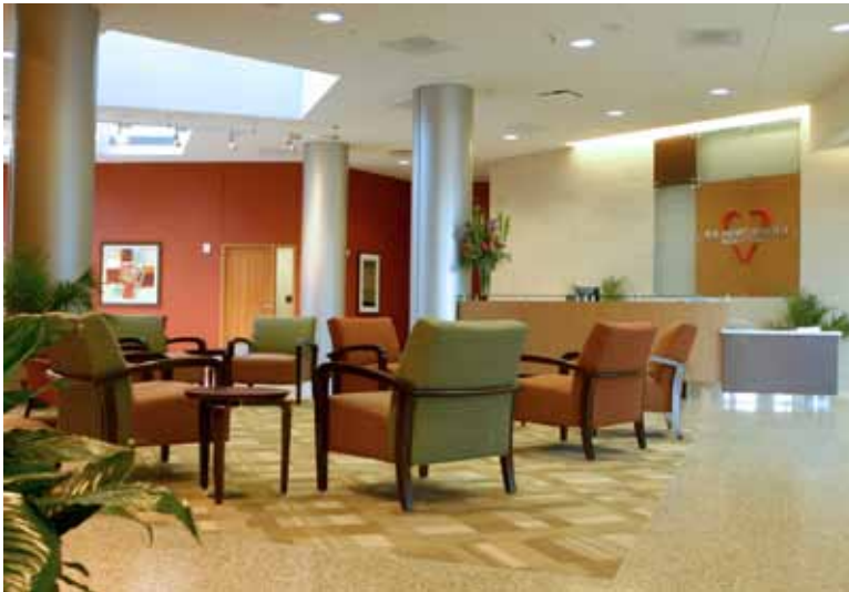
Baylor Heart Hospital | Dallas, TX