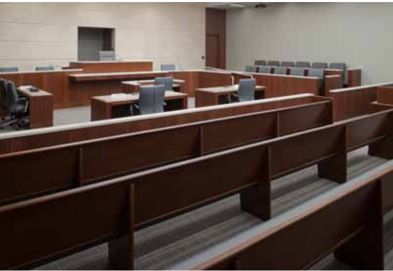
Hays County Government Center | San Marcos, TX