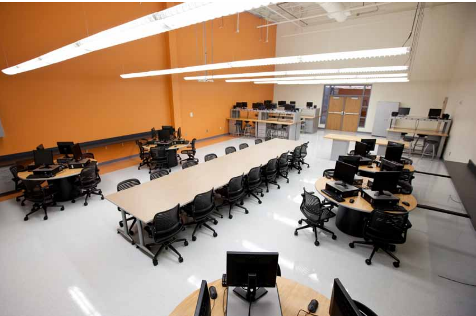
Birdville High School | North Richland Hills, TX