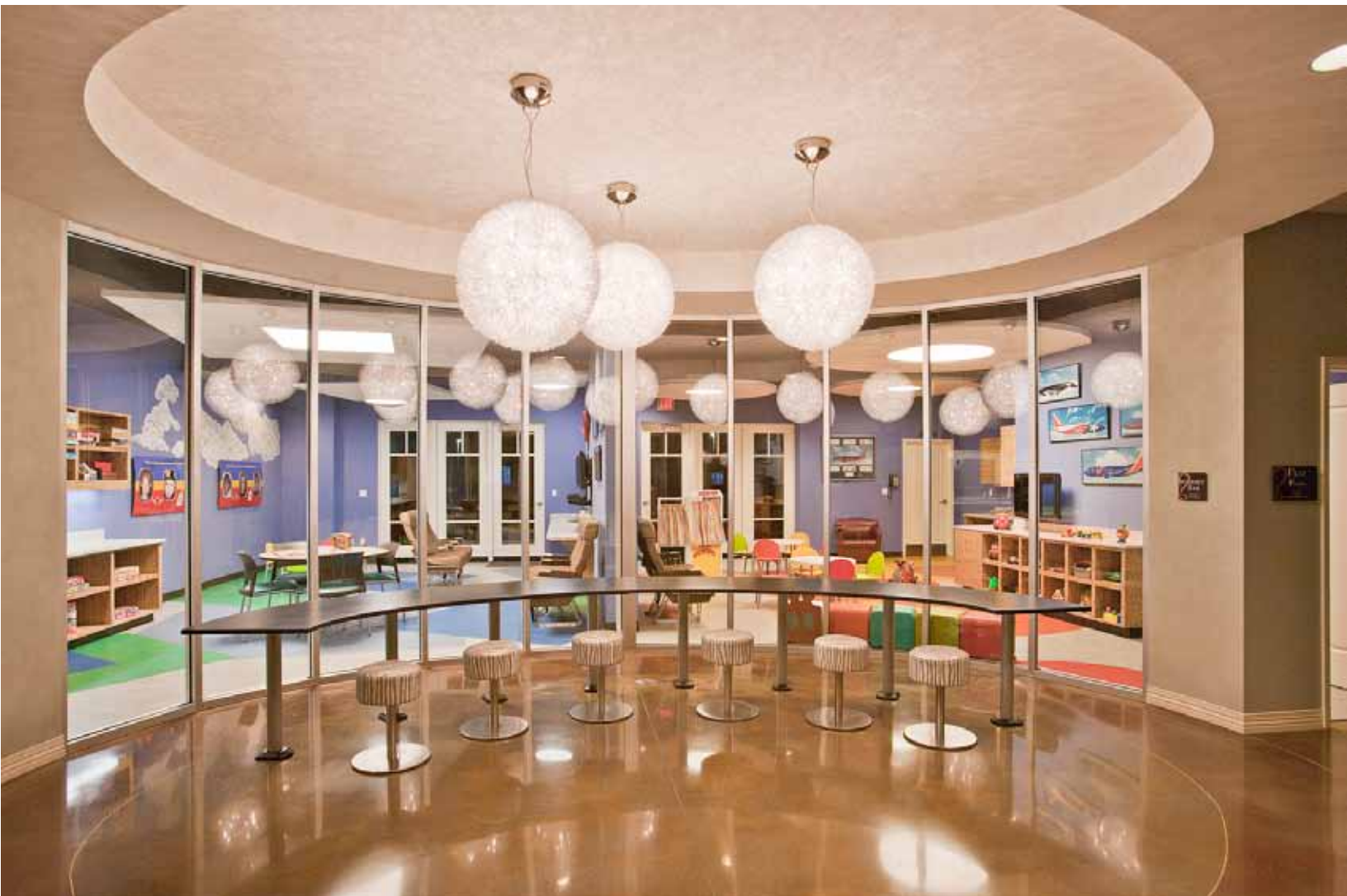
Ronald McDonald House | Dallas, TX