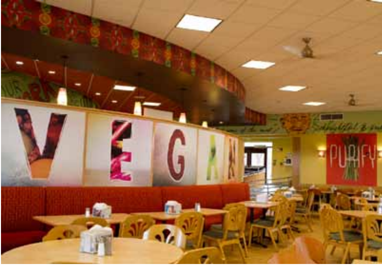
University of North Texas | Denton, TX