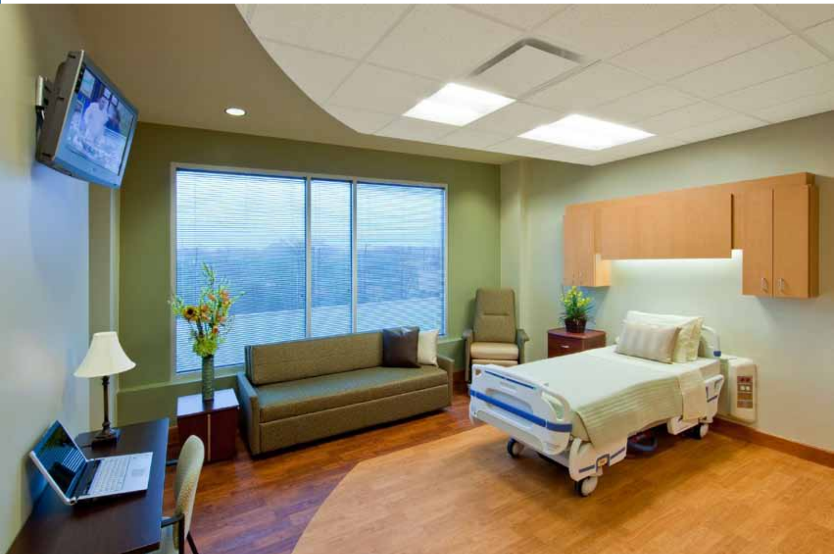
Forest Park Medical Center | Dallas, TX

Caregivers, administrators, clinicians, and patients grow more insistent on having the attractive, reconfigurable, technology-integrated healing spaces driving a global healthcare revolution's successful, cost effective outcomes.