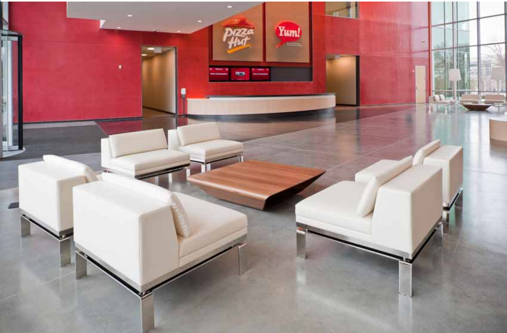
Yum Brands Inc./Pizza Hut | Plano, TX

Business leaders and employees grow more insistent for a new generation of workspaces that attract, inspire, equip and retain the people responsible for revolutionary results in a changing world.