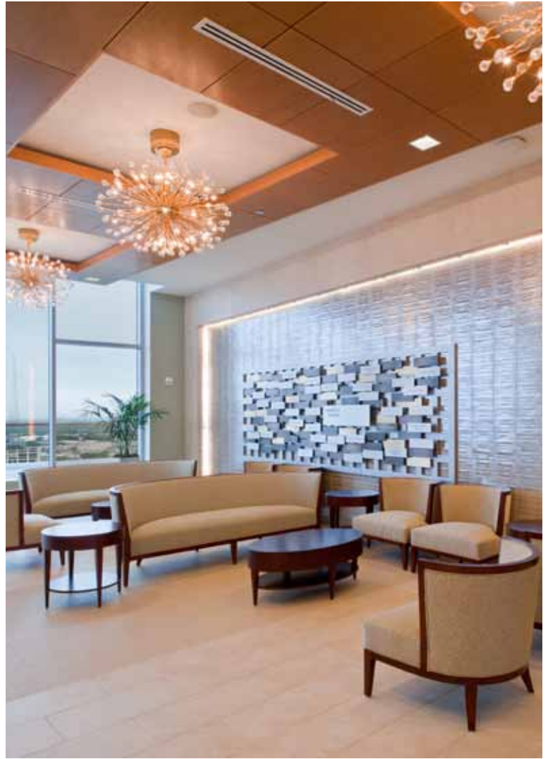
Baylor Outpatient Cancer Center | Dallas, TX