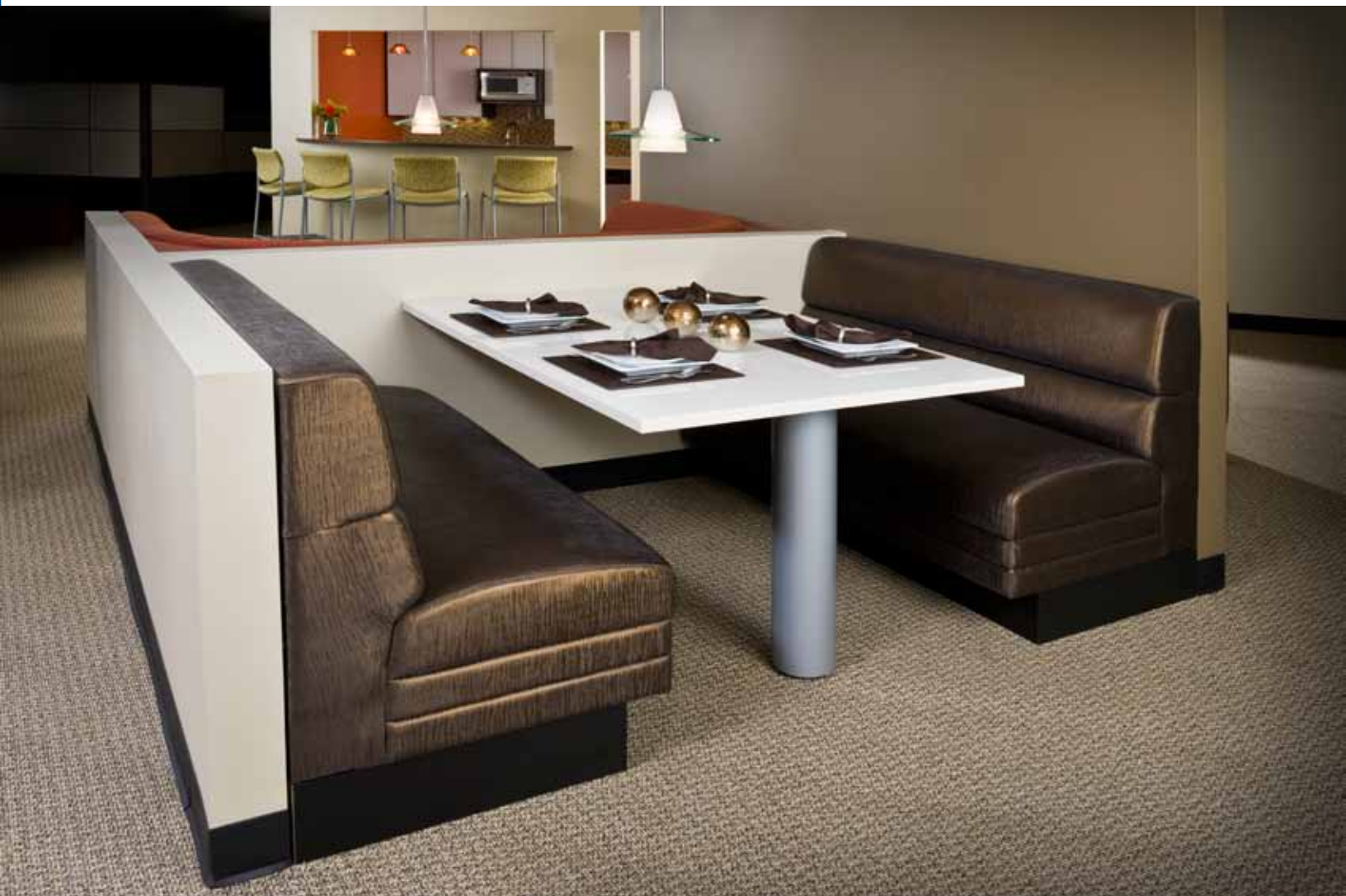
Re-creations Showroom | Dallas, TX

Customized. Remanufactured to new. Refurbished. Blended with new. Integrated with custom case goods and millwork. Beautiful. Practical. Unique.