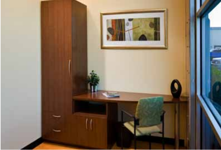
bkm Showroom | Dallas, TX