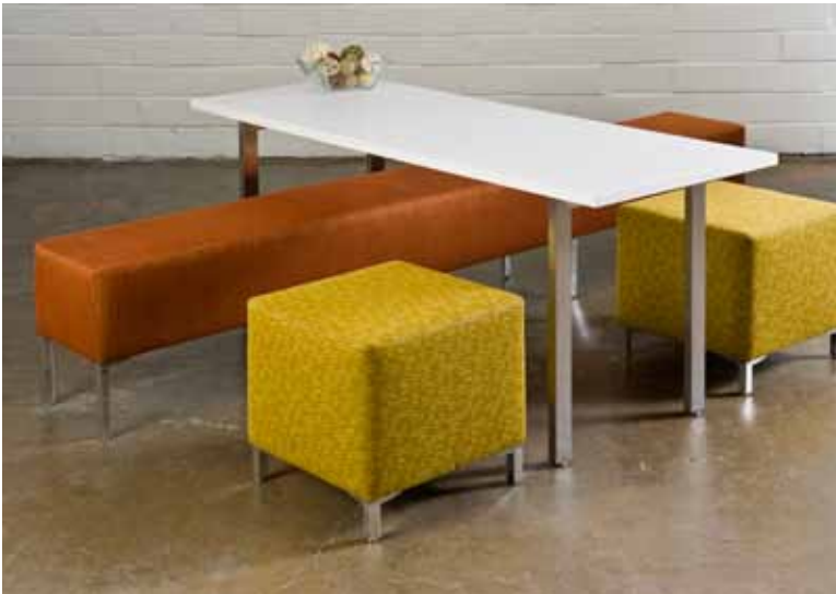
Re-creations Showroom | Dallas, TX